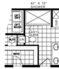
GLAMOUR BATH OPT.