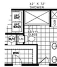
GLAMOUR BATH OPT.